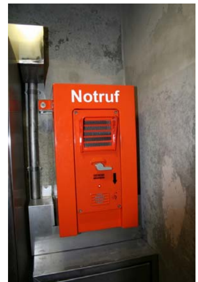
Emergency call phone