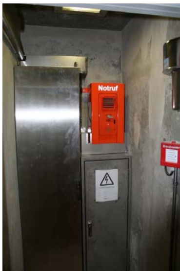
Accessible emergency call recesses