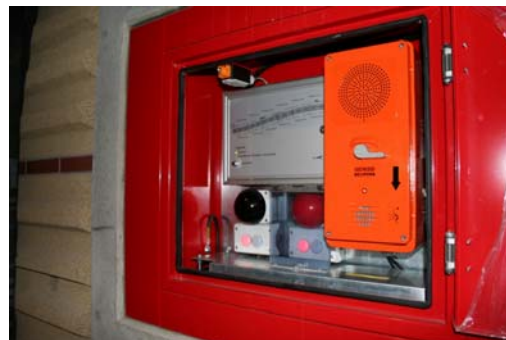
Wall cabinets for firefighters near the tunnel entrances and exits